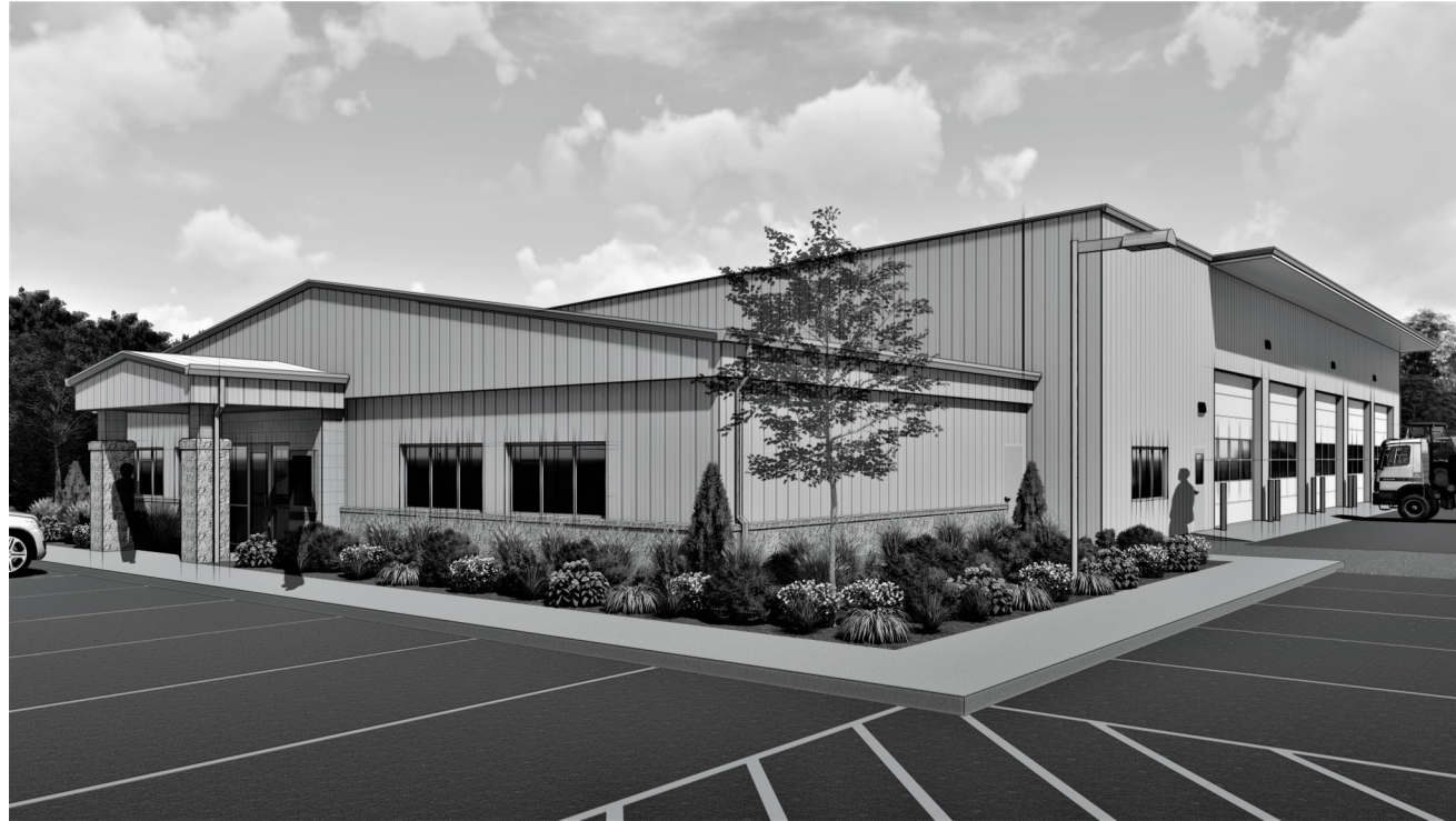
Artist rendition of proposed Town Hall

The Town of Medina, Town Board will be hosting several informational meetings over the next few months to discuss the proposed New Town Hall facility and answer questions. We will also have a representative from Keller and Associates at each meeting. A representative from Baird and Associates will be at our September 15th meeting to answer any financial questions.